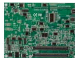
Above: The two 200-pin connectors are located at the back of ESM-2850